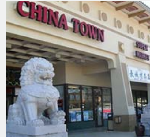
ATLANTA CHINATOWN SQUARE ATLANTA, GA, USA