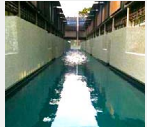
WATTEN RESIDENCES SINGAPORE