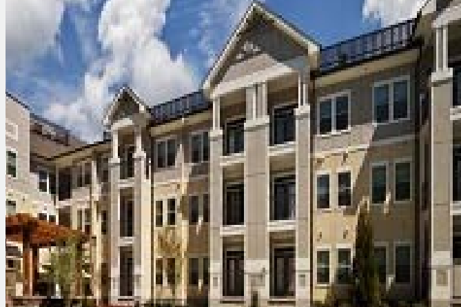
THE VENUE CHARLOTTE, NC, USA