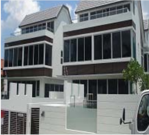
DUNSFOLD RESIDENCES SINGAPORE