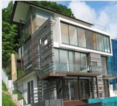
SENTOSA HILLSIDE BUNGALOW SINGAPORE