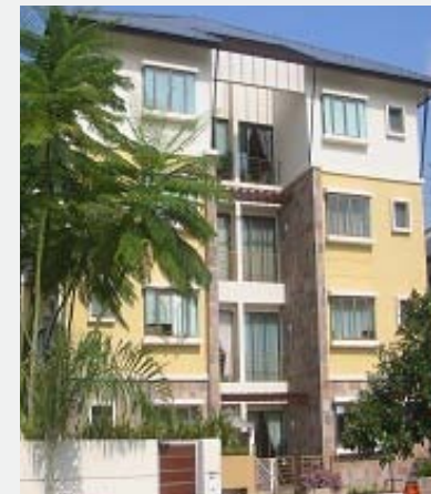
MARTIA 8 SINGAPORE