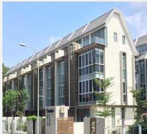
CHARLTON RESIDENCE SINGAPORE