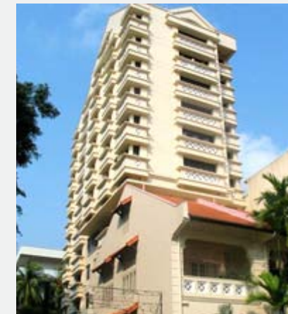
GAMBIER COURT SINGAPORE