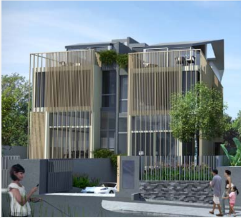
GREENVIEW RESIDENCES SINGAPORE