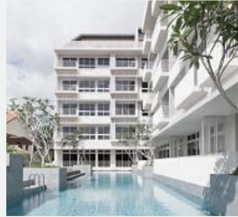
CAMBIO SUITES SINGAPORE