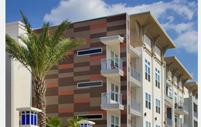
THE UPTOWN AT ST JOHNS JACKSONVILLE, FL, USA