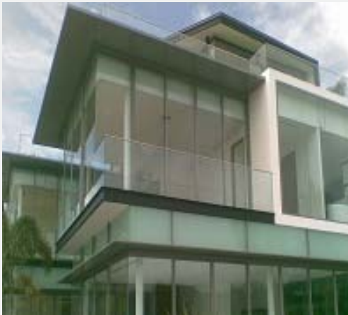
SENTOSA SOUTH COVE BUNGALOWS SINGAPORE