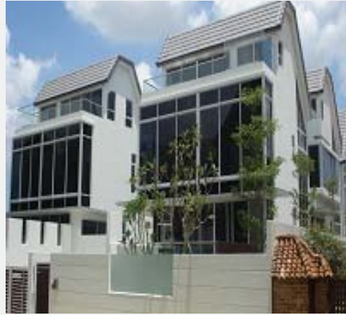
MATLOCK RESIDENCES SINGAPORE