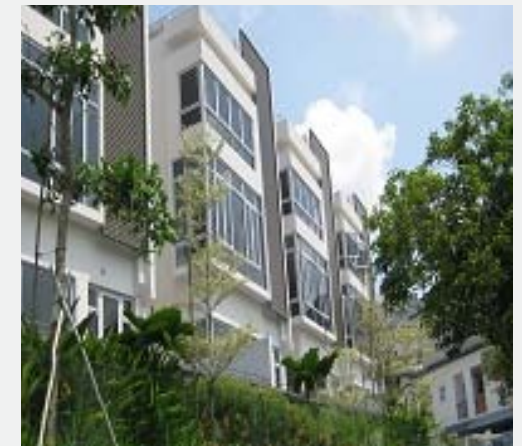
VENTURA HEIGHTS SINGAPORE