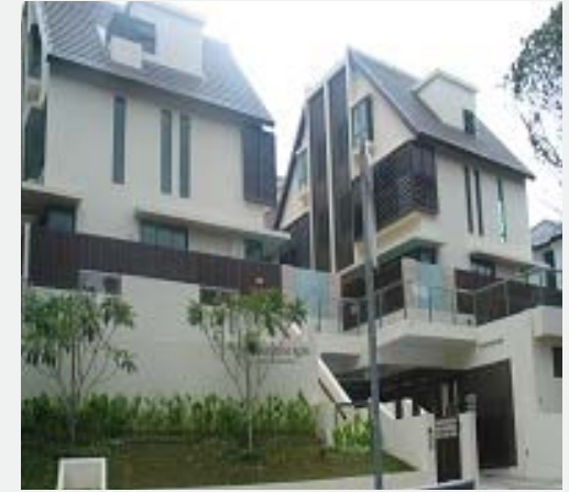
ONE MOUNT ROSIE SINGAPORE