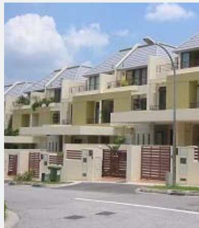
CHISELHURST GREEN SINGAPORE