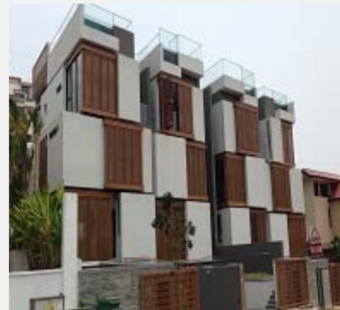
SHELFORD TERRACES SINGAPORE