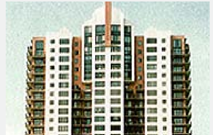
THE GRANDVIEW ATLANTA, GA, USA