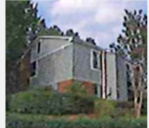
THE VILLAGES OF LAKE TRAIL RALEIGH, NC, USA