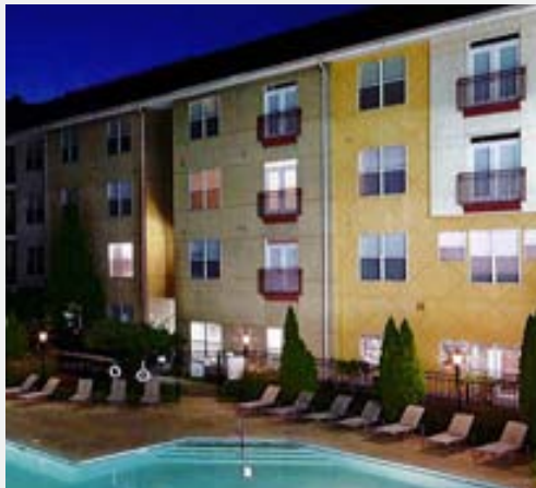
CITY VIEW ATLANTA, GA, USA