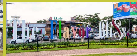
FLAVOR BLISS & SANTA LAURENSIA SCHOOL