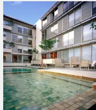
EASTSIDE LOFT SINGAPORE