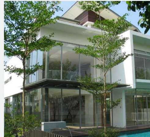
SEAVIEW BUNGALOWS @SENTOSA COVE SINGAPORE