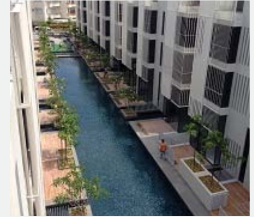
CHARLTON 27 SINGAPORE