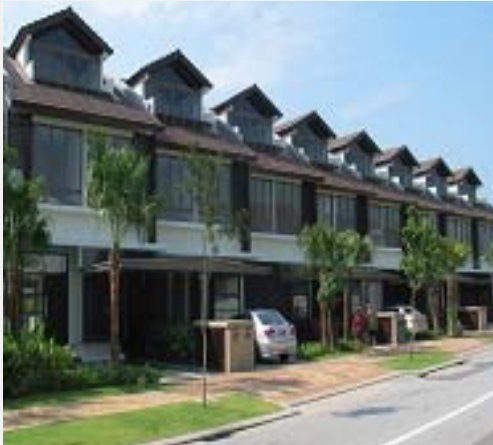
VILLAS AT SENTOSA COVE SINGAPORE