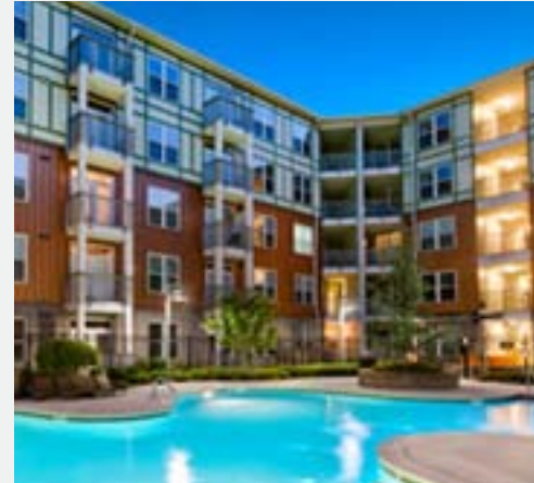
ATLANTIC SQUARE ATLANTA, GA, USA