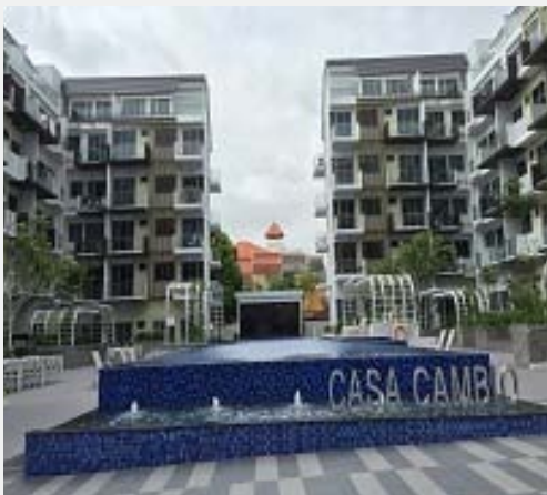
CASA CAMBIO SINGAPORE