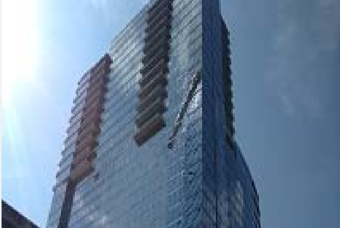
1065 MIDTOWN ATLANTA, GA, USA