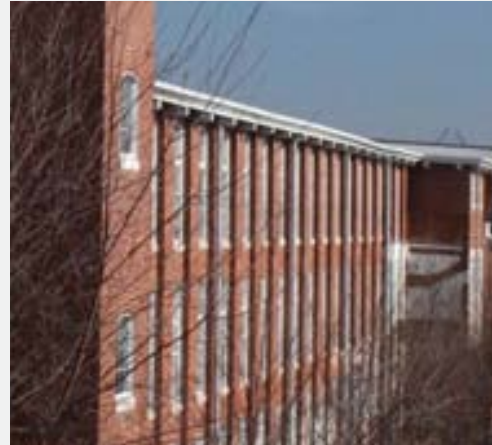
CANTON MILL ATLANTA, GA, USA