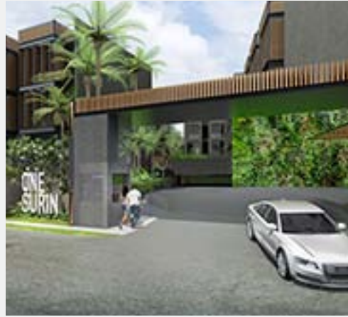
ONE SURIN SINGAPORE