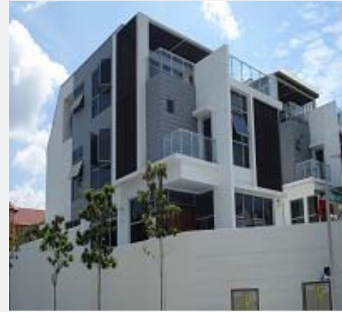
MUSWELL HILL SINGAPORE