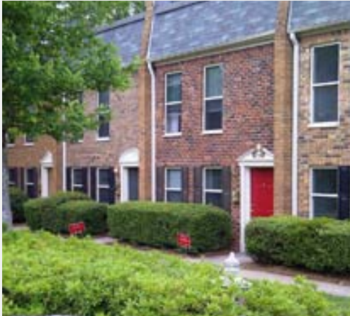
THE AVALON ATLANTA, GA, USA