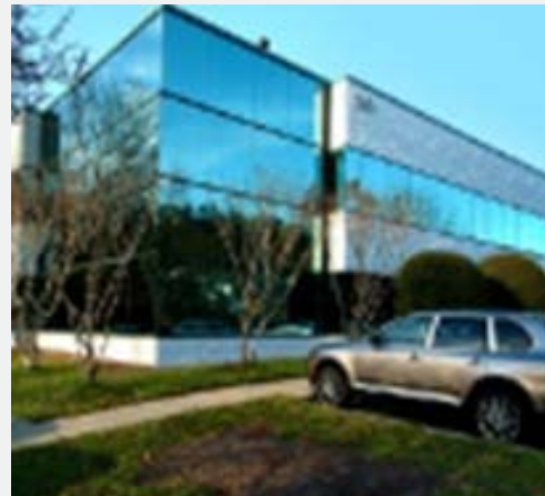
ATLANTA TECH CENTRE ATLANTA, GA, USA