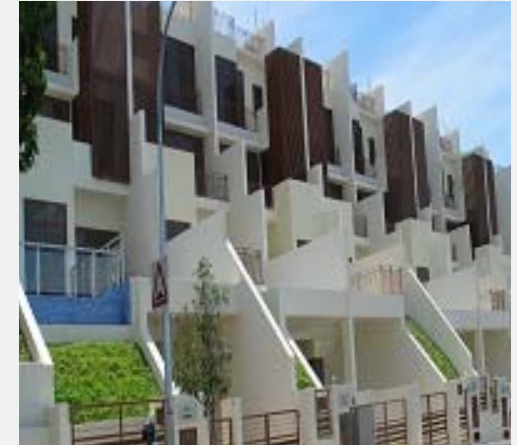
VENTANA VILLAS SINGAPORE