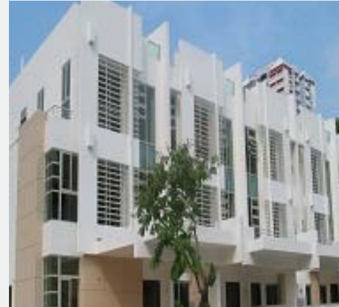
SEA AVENUE TERRACES SINGAPORE