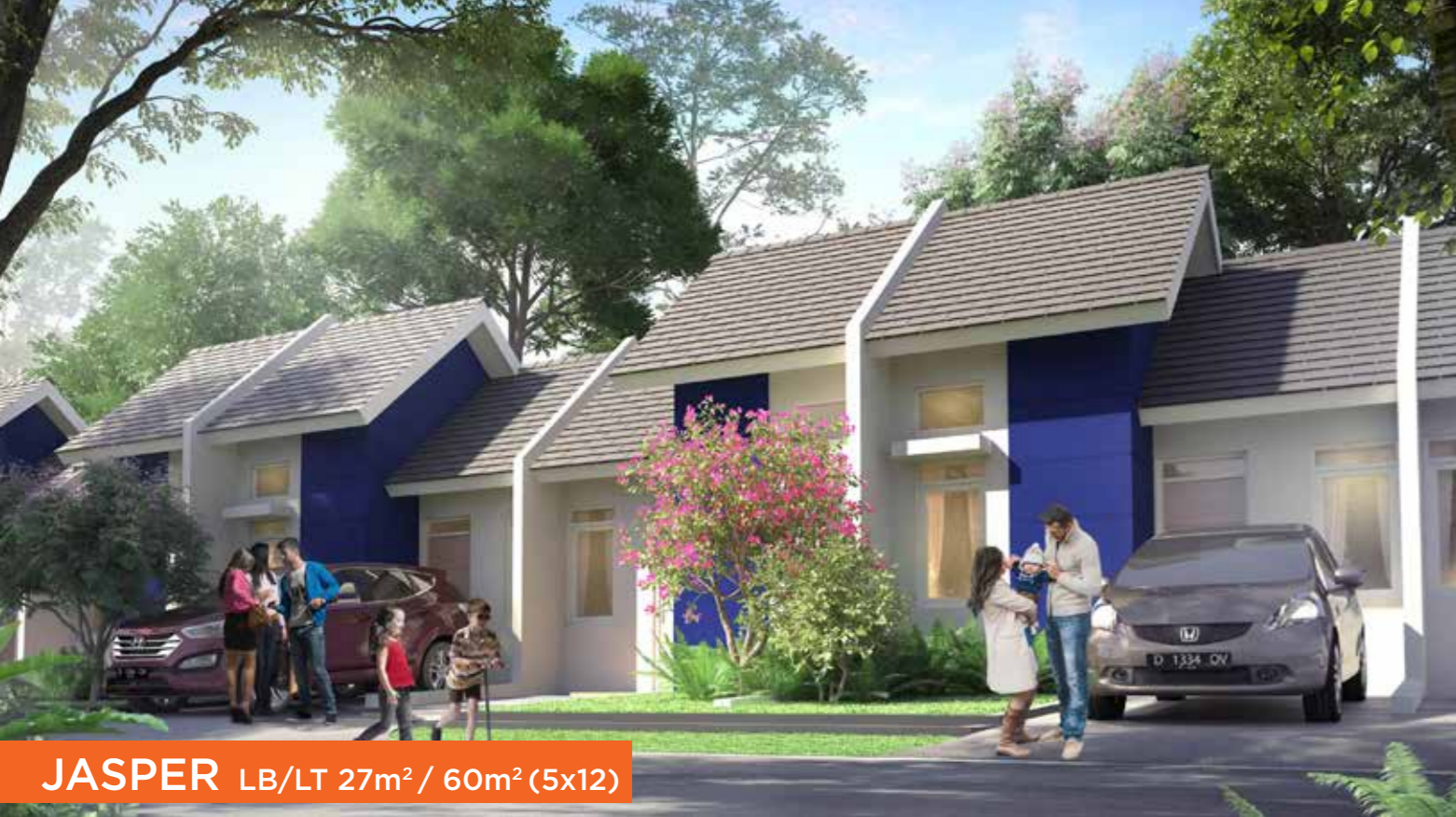
JASPER LB/LT 27m 2 / 60m 2 (5x12)