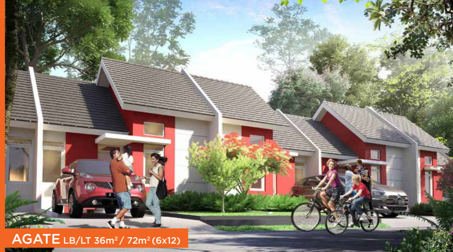
AGATE LB/LT 36m 2 / 72m 2 (6x12)