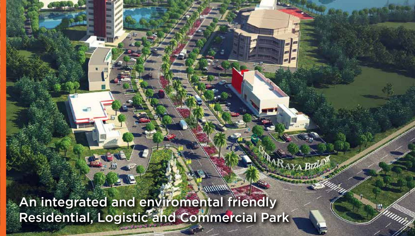
An integrated and environmental friendly Residential, Logistic and Commercial Park