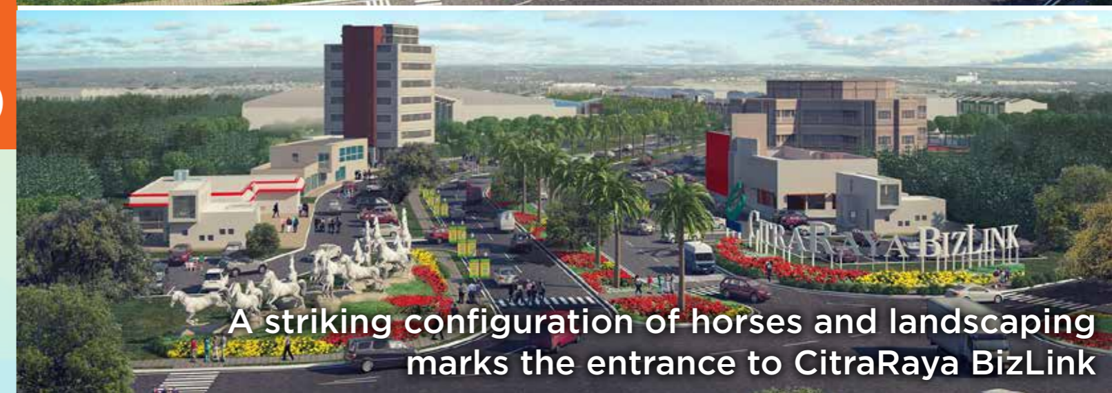
A striking configuration of horses and landscaping marks the entrance to CitraRaya BizLink