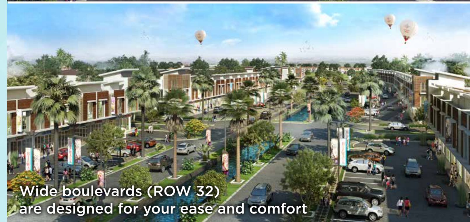
Wide boulevards (ROW 32) are designed for your ease and comfort