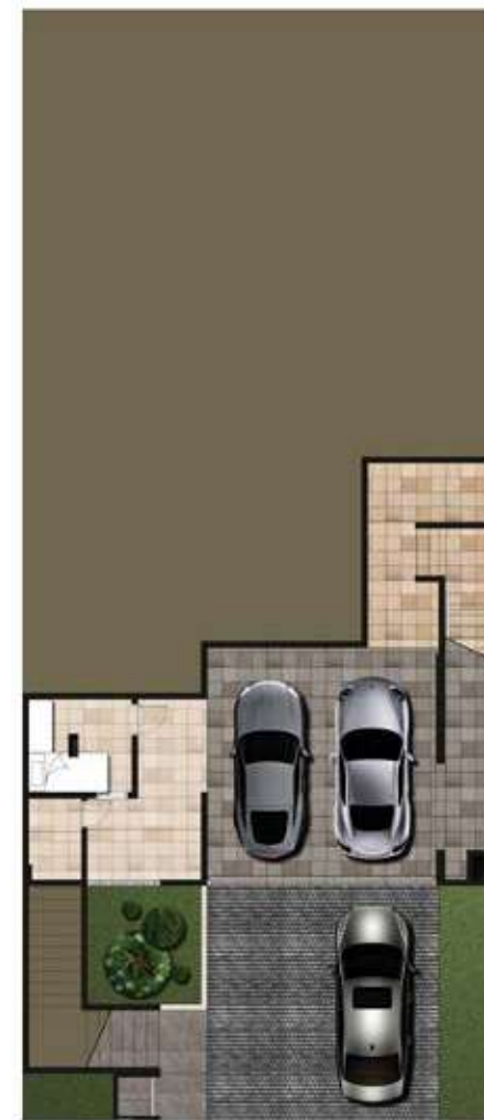
Ground Level 0 1 2 5m