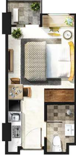
STUDIO SGA : 22.61 m 2