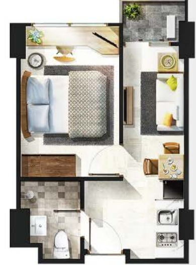
1 BEDROOM SGA : 32.19 m 2