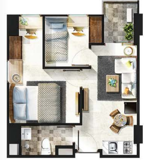
2 BEDROOM SGA : 39.38 m 2